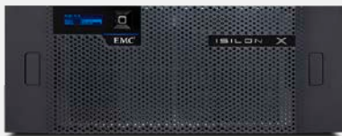
EMC Isilon X410

The EMC® Isilon® X-Series, powered by the OneFS® operating system, uses a highly versatile yet simple scale-out storage architecture to speed access to massive amounts of data, while dramatically reducing cost and complexity. The Isilon X-Series is comprised of two product lines — the Isilon X210, a 2U platform, and the Isilon X410, a 4U platform. The Isilon X-Series is highly flexible and strikes the balance between large capacity and high-performance storage. The X-Series is an ideal solution for high-throughput and high-concurrency applications. With SSD technology for file system metadata and file-based storage workflows, the EMC Isilon X-Series also accelerates namespace-intensive operations.